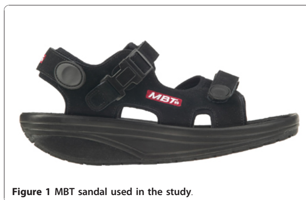
Figure 1 MBT sandal used in the study.

The first set of data was collected with participants walking barefoot. The CODA measurement framework was aligned so that Y-axis was anterior/posterior, the X-axis was medial/lateral and the Z -axis was vertical. The marker placement model used for the current study was based on the model reported by Birch and Deschamp [6]. To enhance the anatomical reliability of marker placement, an MBT sandal (see Figure 1) was used for data collection so the active markers for the CODA system could be placed directly on the anatomical landmarks of each subject and not estimated on the outside of the