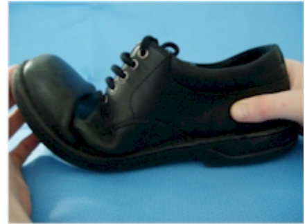
Measurement of sole flexion point