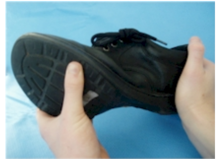
Measurement of midfoot sole torsional stability