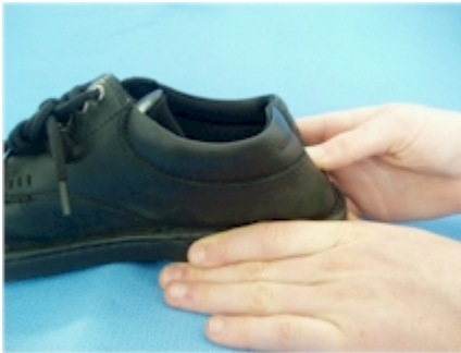
Measurement of heel counter stiffness