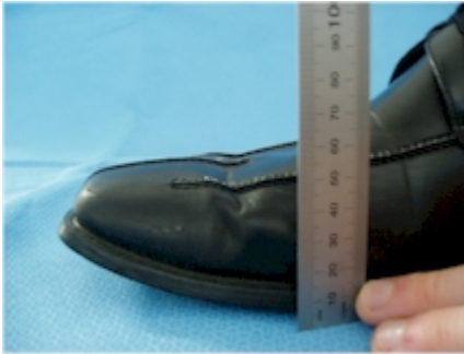
Measurement of forefoot height