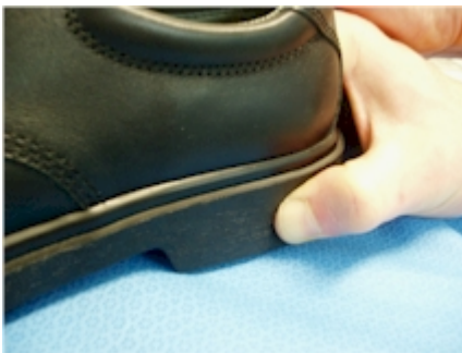
Subjective measurement of lateral midsole hardness