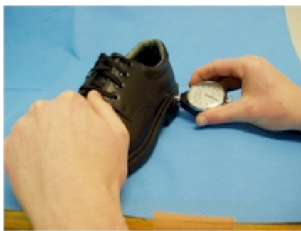
Measurement of lateral midsole hardness using a penetrometer