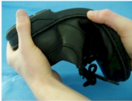
Measurement of midfoot sole sagittal stability