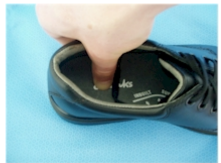
Subjective measurement of heel sole hardness